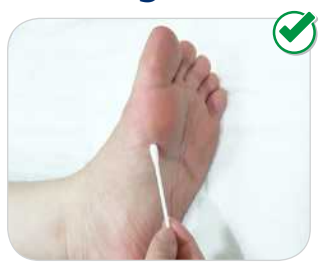
Use 10% urea cream to soften the corn. If it does not work, see a podiatrist or doctor.