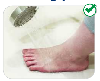
Wash your feet every day with mild soap and warm water.